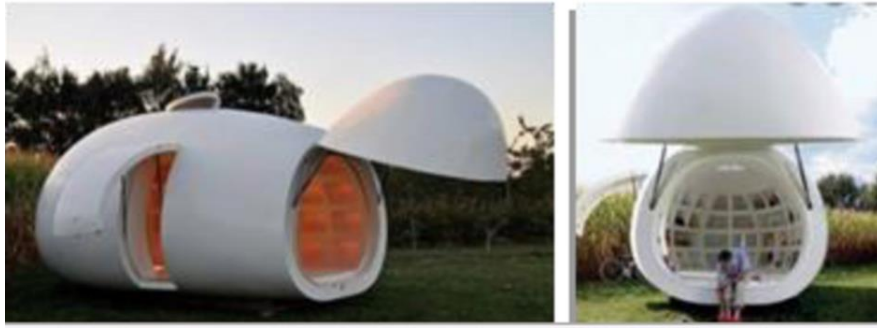
Figure (6) Nano houses as a new type of super-efficient energy homes.

Prosolve was chosen by the hospital partly due to its antibacterial and anti-pollution effects, as well as its memorable visual complexity in form, addressing the issue of urban air pollution. According to recent studies on this technology, the facade of the Torre de Especialidades reduces pollution equivalent to that produced by 1000 cars per day (Figure 7).