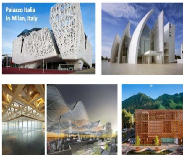
Figure (4) Some of the main

Nanomaterials are not only useful for minor needs such as roofs and facades. They also expand some design possibilities for both sustainable design strategies and architects (Pelin, 2009). Nano building materials are intelligent for achieving energy efficiency and environmental comfort. As shown in Figure 4, we consider the use of nanotechnology in various buildings in the city center