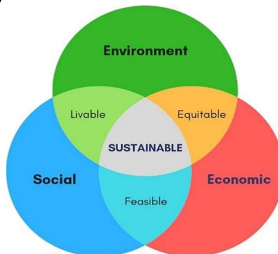
Figure (2) Sustainable Development Goals (Ihab Mahmoud Okba, 2006)