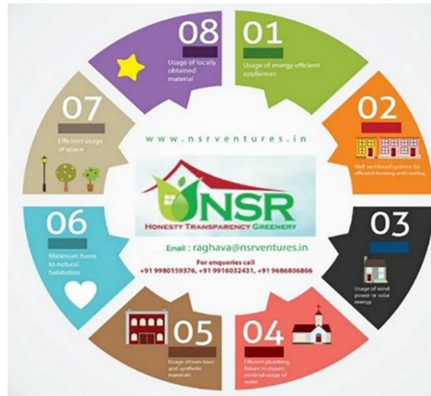
Figure (1) Humanitarian needs according to priorities (Ihab Mahmoud Okba, 2006)

that clarified the relationship between development and the environment. The concept of environmental development encompasses various aspects and is not limited to specific fields or sciences. It represents the entire world, both present and future.