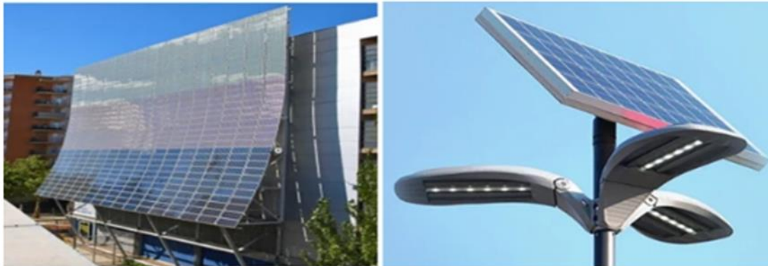
Figure (3) Wind power and biomass energy generation turbines