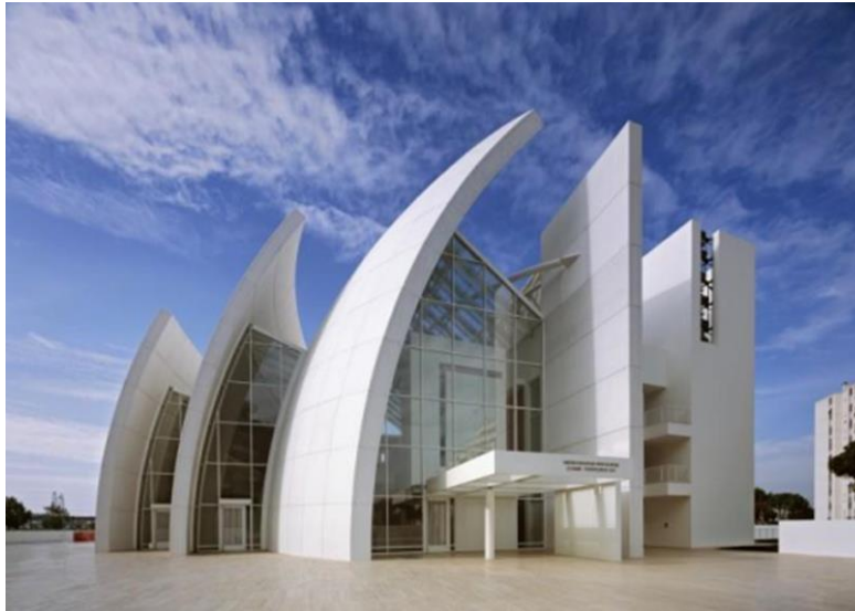
Figure (8) Memorial Church of the Day of Freedom (URL 3)